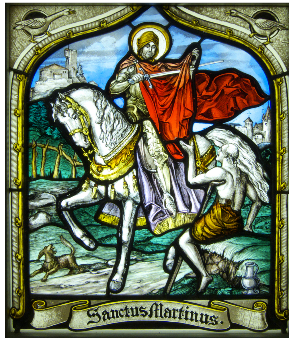
Oakbrook Esser Studios Oconomowoc, Wisconsin Reproduction of a privately owned piece by unknown artist St. Martin , 1999 Antique glass, flashed glass, pigment, enamels, silver staining 16 x 14" checklist #3

Contemporary stained glass artists are also well represented in this exhibition, and in some cases the more recent windows draw on the same biblical and extra-biblical stories as some of the older windows in the show. As I mentioned above, in the discussion of the 1878 Epiphany window from Mayer of Munich, extra-biblical traditions, stories that are not found in the New Testament, developed around