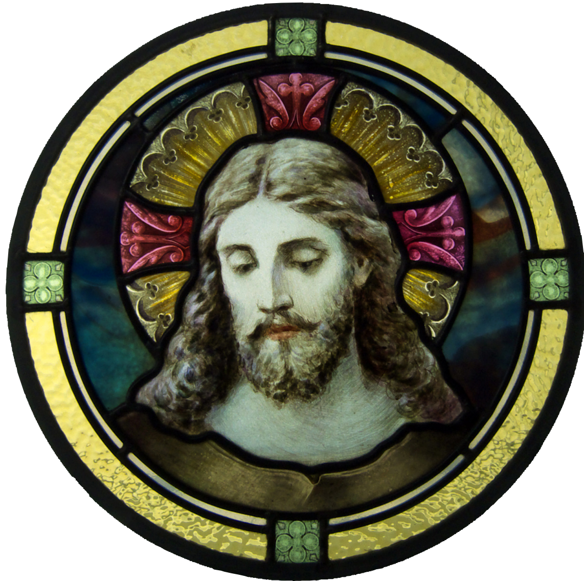
Attributed to Tiffany Studios New York, New York Setting fabricated by Oakbrook Esser Studios Oconomowoc, Wisconsin Head of Christ , c. 1900, setting c. 1985 Opal glass, antique glass, pigment, enamels 15 x 15" checklist #15