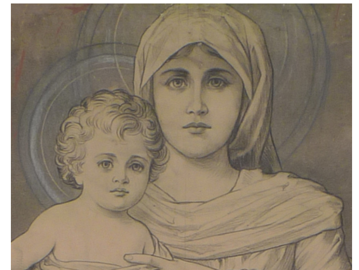
Jacoby Art Glass Company St. Louis, Missouri Mother and Child , (detail) c. late 19th/early 20th century Charcoal on photosensitive paper and craft paper mounted on linen 46 x 20" checklist #29

It would be my wish that everyone comes away from this exhibition with a greater appreciation and understanding of our craft and all of the talented artisans that work in this field. This exhibition is dedicated to their commitment to excellence. I am blessed to be a small part of such an honored trade.