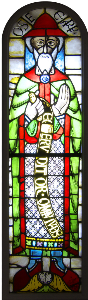
Oakbrook Esser Studios Oconomowoc, Wisconsin Reproduction of late 11th/early 12th century window from Augsburg Cathedral Augsburg, Germany Hosea , Early 1990s Antique glass, flashed glass, pigment, silver staining 74 x 19" checklist #1

The title of this exhibition, Let There be Light , is lifted from the first chapter of Genesis, the first book of the Old Testament (“God said: ‘Let there be light!’; and there was light”). A reference to light is particularly appropriate for an exhibition featuring stained glass windows: natural daylight is essential for this particular art form. In the 21st century we can, of course, backlight the pieces you see here at the Haggerty Museum: you can enjoy this exhibition rain or shine, night or day.