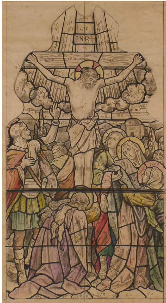
Jacoby Art Glass Company St. Louis, Missouri Christ on the Cross , (detail), c. late 19th/early 20th century Charcoal and watercolor on paper 70 x 34 1/2" checklist #24

By showcasing the different stages of the stained glass process, one can get a glimpse into all of the steps involved in creating a finished window. One of my favorite groupings in the show is the series of full-size drawings created by the Jacoby Art Glass Company of Saint Louis, Missouri. They have strength on their own and are themselves beautiful works of art, however, for the most part, are forgotten. To a studio they represented an important step along the path to the window's completion. These 19th and 20th century drawings were discovered by an artist working in the former Jacoby building years after the company was acquired by Oakbrook Esser. The Haggerty staff has always had a special interest and enthusiasm for these drawings. In the early planning stages, we all realized they would become an important component of the show. Art needs to be shared to touch people and I am grateful for their support.