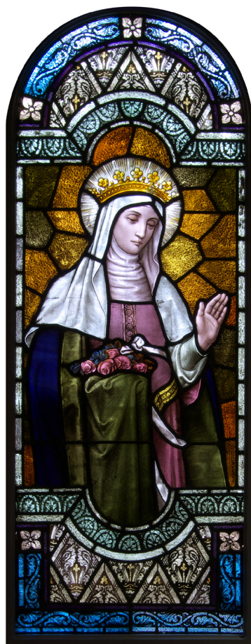
Unknown Artist and Studio St. Elizabeth , c. 1900 Antique glass, flashed glass, pigment, enamels, silver staining 53 x 20" checklist #6

Saints have also traditionally been a staple of stained glass windows; in this exhibition, we see, among others, St. Martin, St. Agnes, and St. Elizabeth. The reproduction of a privately owned stained glass window of St. Martin bears his name; a somewhat unnecessary touch, since he is one of the most familiar and recognizable of Christian saints, and his story, with a number of regional variations, one of the best known (checklist #3). The basic story: Martin was a soldier in the fourth century; one day, when he encountered a poor beggar, he split his military cloak in half and shared it with the poorly clothed man. That night, Martin dreamed that Jesus was wearing the half-cloak he had given to the beggar. Martin was baptized, served in the army for another couple of years, and then left in order to devote himself to religious life. This stained glass window depicts Martin in the act of splitting his cloak; the geese up in the corners are a reference to the fact that the food traditionally eaten on November 11, St. Martin's Day, in many European countries is goose (according to the tradition, Martin was reluctant to become a bishop, and he hid in a stable filled with geese; the noise made by these fowl betrayed his hiding place).