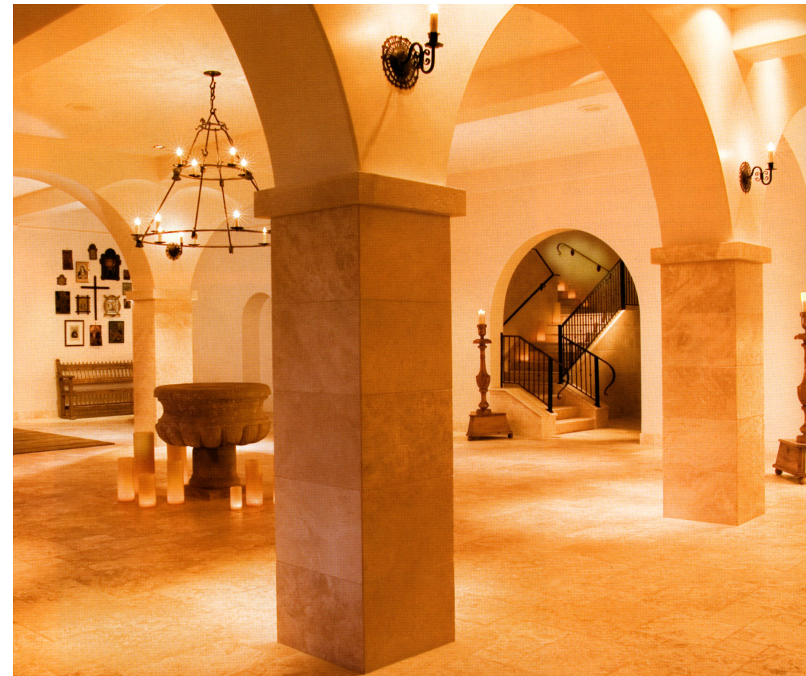
The newly renovated Saint Francis Hotel where Haggerty Friends will stay while in Santa Fe

The Friends of the Haggerty Museum of Art invite you to join them on a five-night trip to Santa Fe, New Mexico, September 14-19, 2010. Enjoy the finest museums, galleries, and restaurants while staying at the Saint Francis Hotel in the heart of Santa Fe.