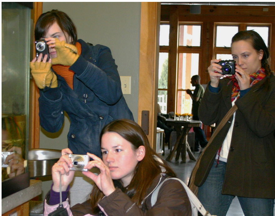
Marquette students at the Urban Ecology Center in February for Haggerty workshop