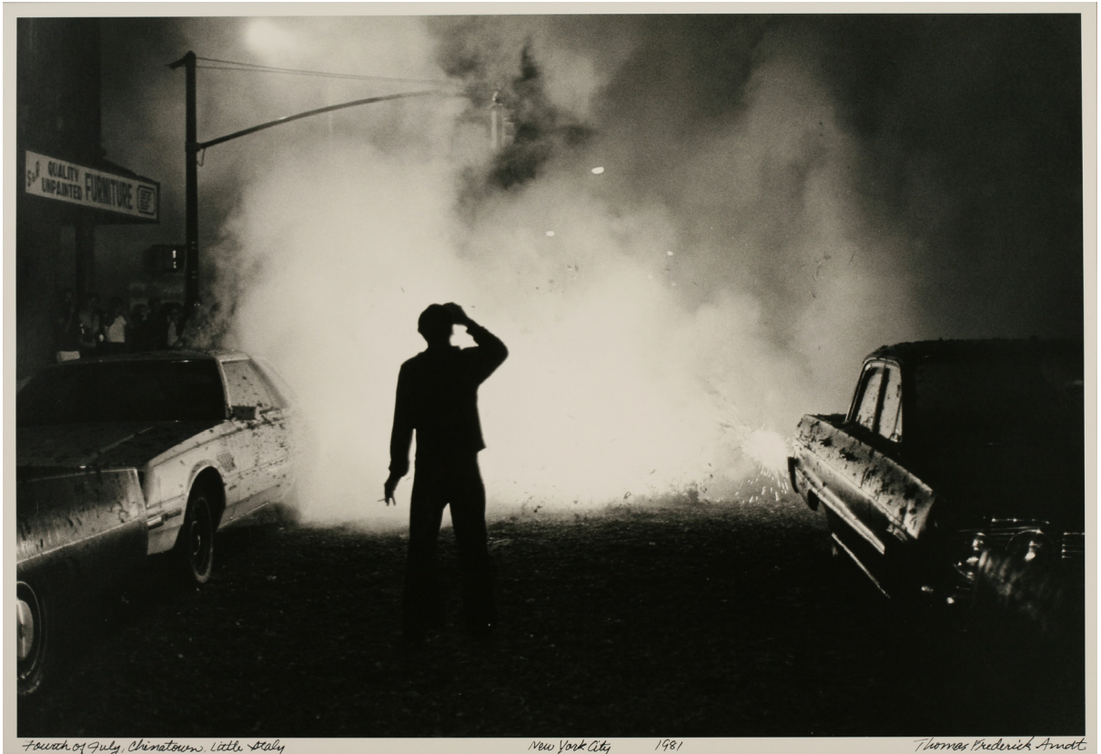
Fourth of July, Chinatown, Little Italy