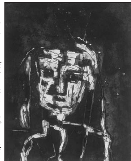
Louise Nevelson, Noble Lady Etching and aquatint, 19 3/4 x 15 1/2 in. Gift of the Sybil B. Berkman Foundation, 2000.24.23