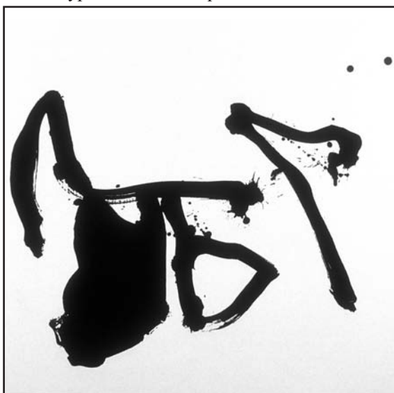
Robert Motherwell, Signs on White , 1981 Etching and aquatint, 20 x 28 in. Gift of the Sybil B. Berkman Foundation, 2000.24.12