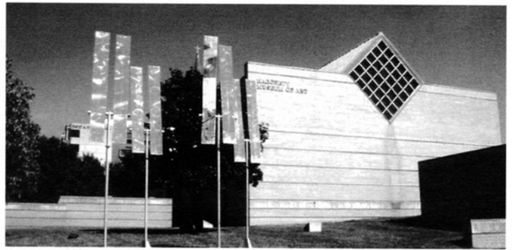
Rainbow Machine , a sculpture by Joseph Burlini, installed on Haggerty Museum grounds.

A portion of your membership contribution may be tax deductible to the extent allowed by law.