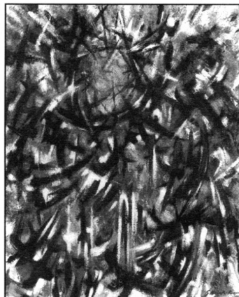
Guido Brink, The Crown of Thorns , 1958 Oil on canvas, 68 x 48 in. Collection of the artist

(State Academy of Fine Arts), Düsseldorf, under the neo-impressionist