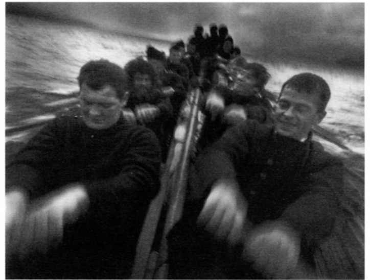
Ragnar Axelsson (b. 1958, Iceland), Rowing to a Birthday Party, between two Faroe Islands , 1998, gelatin silver print, 10 7/8 x 14 in. Collection of the artist

Swede Lars Tunbjörk captures humorous and touching moments in photographs of his countrymen, illustrating the depth of human emotions that the camera can capture in the hands of a skillful photographer.