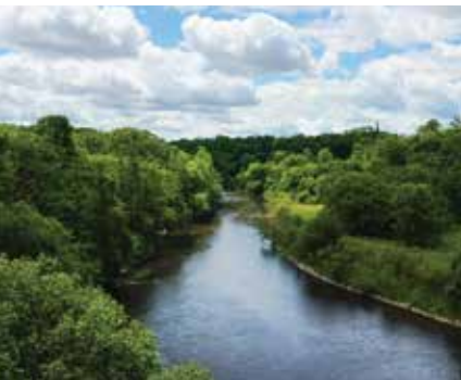
The Milwaukee River