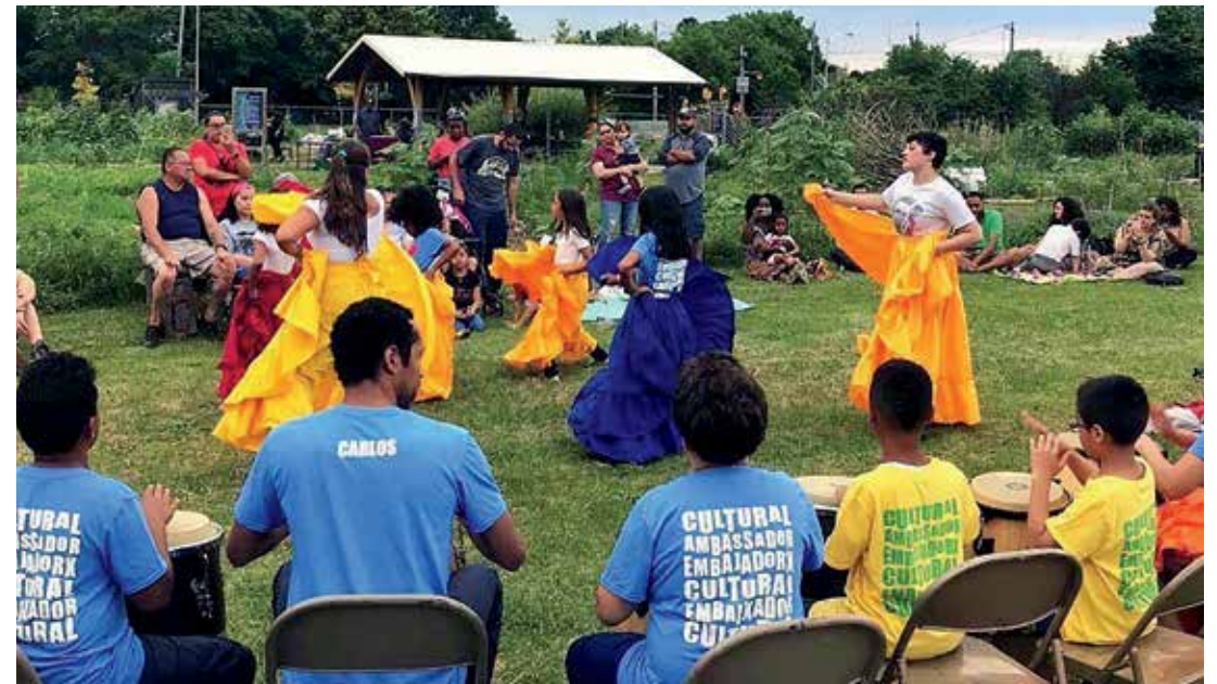
Bembé drum circle at Alice's Garden in Milwaukee